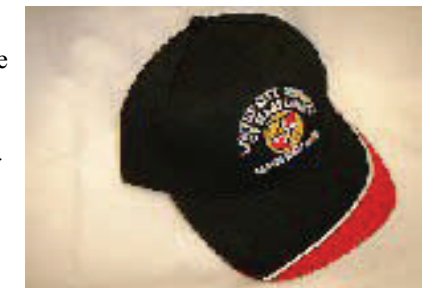
USMH Ballcap: $15.95

Street, next to the Square, the Visitor Welcome Center is the official outlet for University System of Maryland - Hagerstown logo items. For more information about Hagerstown-Washington County, or to find out more about the gift shop, call 301-791-3246. Additionally, many of the store's items are sold on the Welcome Center's secure web site at: www.marylandmemories.com . The web site also is an outlet for ticket sales for many local Hagerstown-Washington County events.