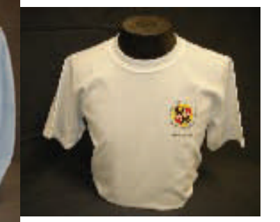
USMH T-shirt: $14.95