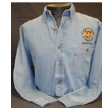
USMH Denim shirt Men's and women's sizes: $35.95